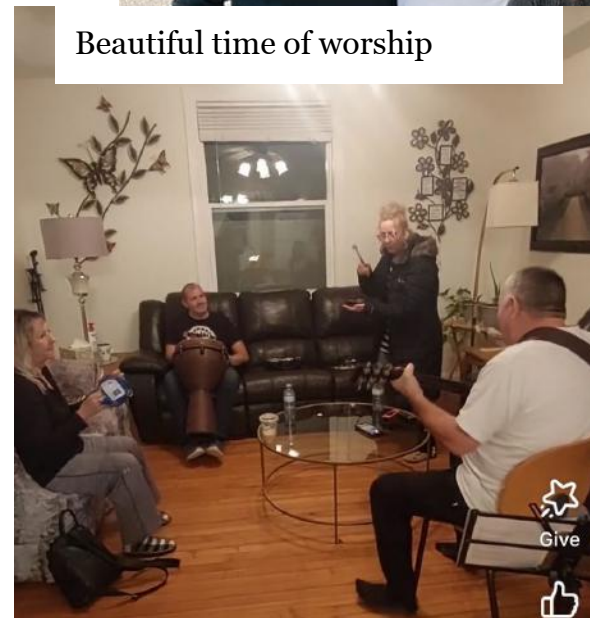
Beautiful time of worship